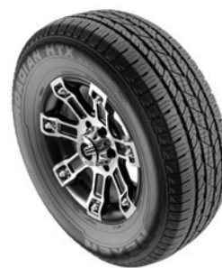
ROADIAN HTX RH5